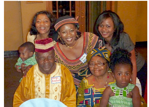
Cameroonians celebrate the Malaria Eradication campaign "Nothing But Nets" at UN Day Dinner